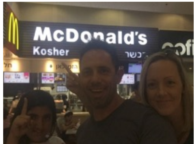
Hmm? What's wrong with this picture?