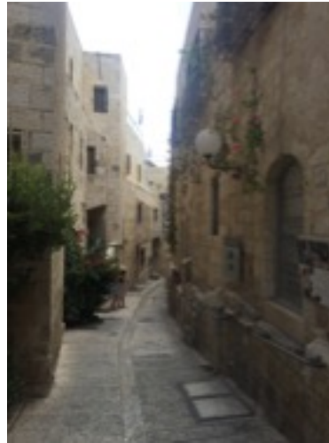
The winding streets of ancient Jerusalem