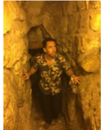
Underneath the Western wall.