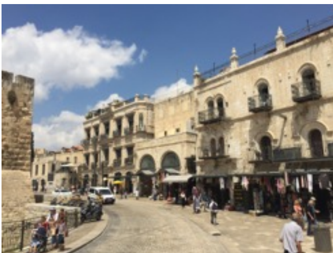
Just the most amazing feeling to be standing in the market place of history.