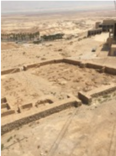
Roman Camp at the foot of Masada

They say that a picture tells a thousand words and so I thought that this particular newsletter will be a very different one. Normally you all get to hear me ramble on about the different things but for now, enjoy the photos.